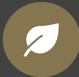
Indoor Environmental Quantity

The aim of this policy is to incorporate ecologically sustainable development principles in every facet of design, manufacturing and installation with the introduction of the following six key objectives: