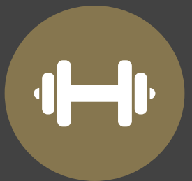
High Load Areas