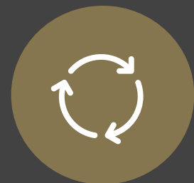
Life Cycle Analysis